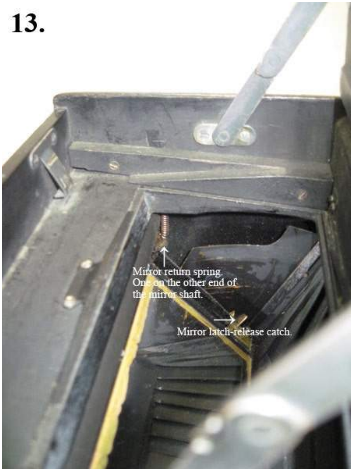
Mirror return spring and latch detail.